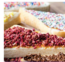
SPREAD AND TOPPING