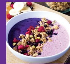
NATURAL FLAVOURING AND COLORING IN CHOCOLATES