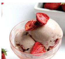
ICE CREAM TOPPING