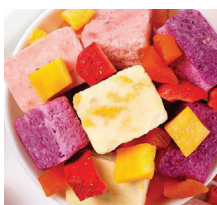
READY TO EAT YOGURT BITES

Freeze-dried fruits and powders can be used in various applications in the dairy segment. As it has low water activity there are fewer chances of contamination which is ideal for dairy as most of the products are not thermally treated. Freeze-dried fruits are also used in the application where maintaining the structural integrity of fruit for visual appearance is the focus. Freeze-dried Fruits not only add natural Flavour and color to the product but also increase the nutritional Value.